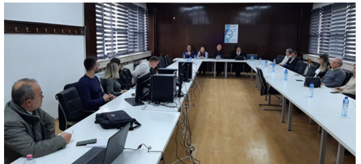
Business-academia workshop in Prishtina