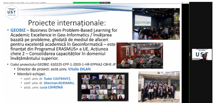
Presentation of the GEOBIZ Project results in 2021

and its implementation) and institutional development (strengthening of institutional capacity through involvement in some trainings/workshops/summer schools of the representatives of the Faculty of Geography in online and/or physical format; signature of Agreements of cooperation between UST and several business representatives etc.)