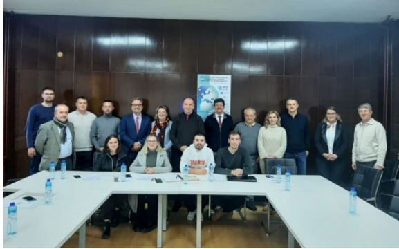
Business-academia workshop in Prishtina

Academia cooperation. The first topic was titled "System, mission, organization, mandate, coordination of emergency operations" where the activities from Emergency Management Agency and requests for geoinformation from various sources were presented.